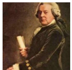
John Adams 2nd U.S. President and Signer of the Declaration of Independence: