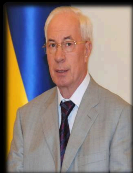
3/2013 "Unification of Svoboda with other opposition forces is not funny but dangerous" Prime Minister Mykola Azarov

"There is only the fight". Hillary's senior thesis. "An Alinsky Model.