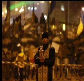
3/2013 "Unification of Svoboda with other opposition forces is not funny but dangerous" Prime Minister Mykola Azarov