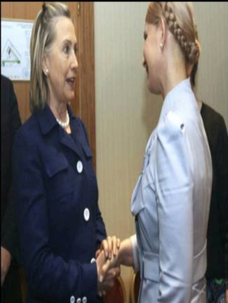
Hillary Clinton Praises Viciously Anti-Semitic Ukrainian Neo-Nazi Leader Secretary of State Hillary Clinton and Ukrainian neo-Nazi leader Yulia Tymoshenko at a reception held in Kiev in 2010.