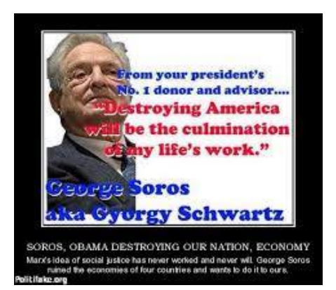
George Soros #1 donor to immigration reform NGO's.

After the long awaited <u>immigration reform [amnesty for illegal</u> <u>aliens]</u> in the United States was suspended by the House of Representatives in 2013, a report published on Tuesday revealed that businessman George Soros increased the amount of donations to political groups who favor legislation in immigration matters in the United States.