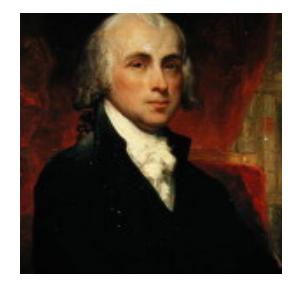
James Madison Father of U.S. Constitution

"The government of the United States is a "definite" government, confined to specified objects it is not like the state governments, whose powers are more general. Charity is NO part of the legislative duty of government". James Madison Father of US Constitution speech, House of Representatives, during the debate "On the Memorial of the Relief Committee of Baltimore, for the Relief of St. Domingo Refugees". January 10, 1794.