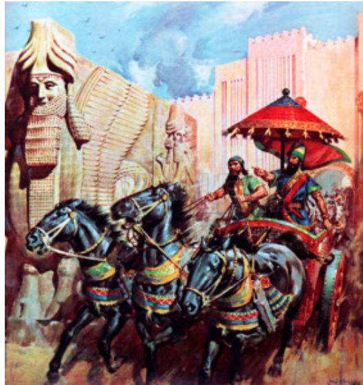
Ancient Assyrians conquered Israel circa 721 B.C.

History of Israel's destruction in Isaiah 9 by Ancient Assyrians due to being lead into idolatry by King Solomon in I Kings 11 .