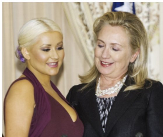
Christina Aguilera chats Hilary Clinton eyeing her cleavage

Christina Aguilera catches Hillary Clinton eyeing