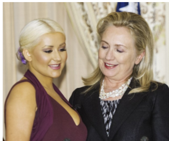
Christina Aguilera chats Hilary Clinton eyeing her cleavage

Christina Aguilera catches Hillary Clinton eyeing