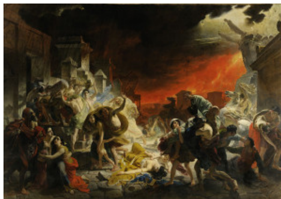
The Last Day of Pompeii Sex

Due to this unprecedented persecution , the Christians believed that their generation would be the final one before the end of the world. The great Apostle Paul , who established Christianity at Rome, was beheaded outside the city by order of Nero.