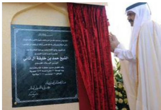
Qatari Emir inaugurates ‘Imam Muhammad Ibn Abdul Wahhab’ Mosque in Doha,

12/2011 Qatari Emir inaugurates ‘Imam Muhammad Ibn Abdul Wahhab’ Mosque in Doha, vows to spread ‘teachings of Islam in whole world’ .