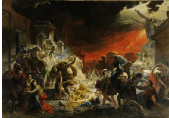
The Last Day of Pompeii Sex Capitol of The World destroyed within hours Eruption of Mount Vesuvius in 79 A.D.

Due to this unprecedented persecution , the Christians believed that their generation would be the final one before the end of the world. The great Apostle Paul , who established Christianity at Rome, was beheaded outside the city by order of Nero.