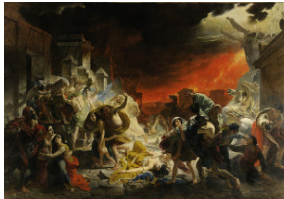
The Last Day of Pompeii Sex Capitol of The World destroyed within hours Eruption of Mount Vesuvius in 79 A.D.

Due to this unprecedented persecution , the Christians believed that their generation would be the final one before the end of the world. The great Apostle Paul , who established Christianity at Rome, was beheaded outside the city by order of Nero.