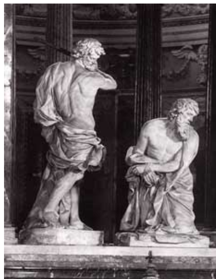
Beheading of St. Paul