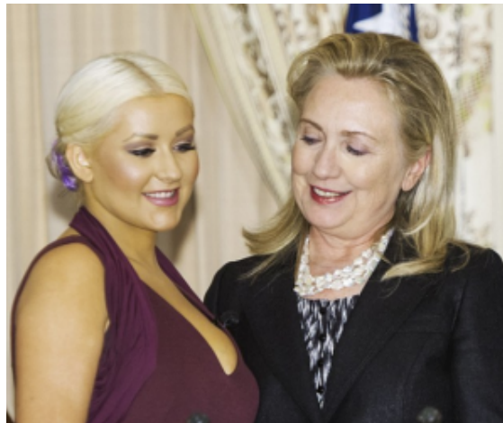
Christina Aguilera chats Hillary Clinton eyeing her cleavage

Christina Aguilera catches Hillary Clinton eyeing