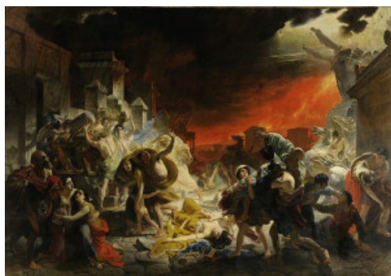
The Last Day of Pompeii Sex

Due to this unprecedented persecution , the Christians believed that their generation would be the final one before the end of the world. The great Apostle Paul , who established Christianity at Rome, was beheaded outside the city by order of Nero.