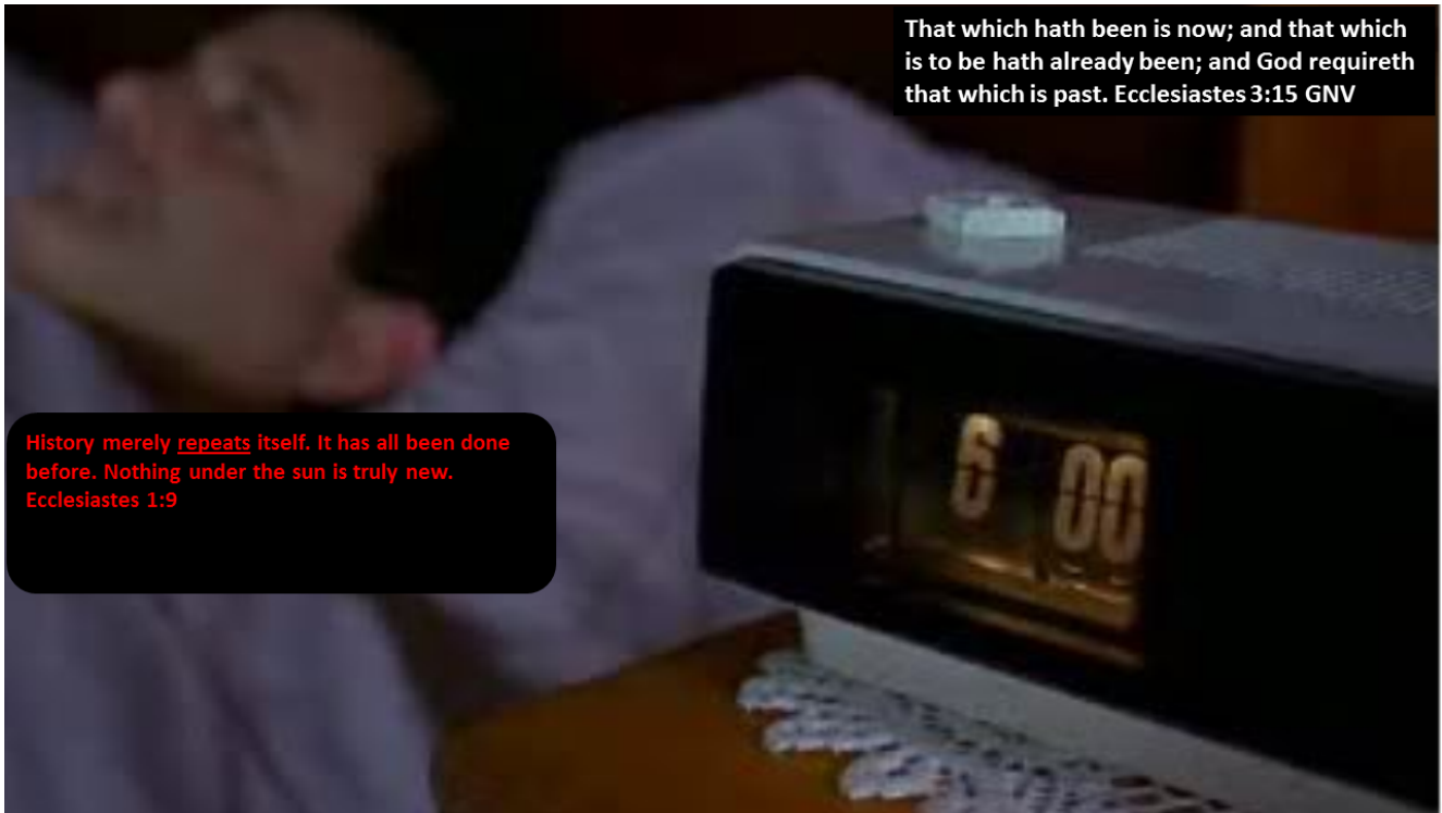
“Ground Hog Day” starring Bill Murray

The collapse of Ancient Greece followed by Ancient Rome’s overthrow by Abbasid Caliphate resulted in bleakest period in Modern World History “The Dark Ages.” Italian poet and statesman “Dante” paintings were depicted in art during Renaissance Period.